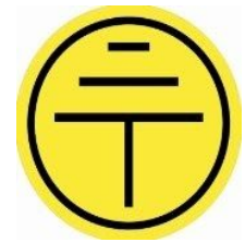
Hazard Earthing Point